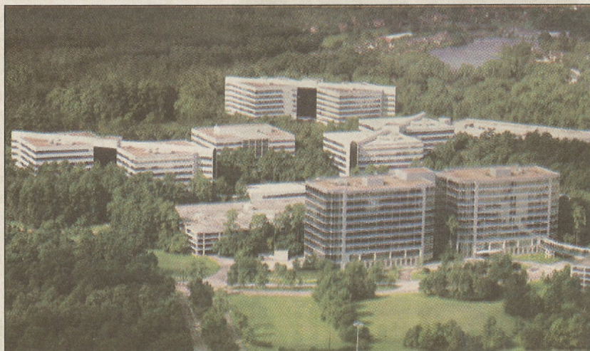
The portion of the HP campus that is being offered for sale (pictured) has an estimated replacement value of $527 million.

The Palo Alto, Calif.-based computer company — which purchased Houston-based Compaq for $19 billion in 2002 — is consolidating employees into certain parts of its Northwest Houston campus so it can market 2.09 million square feet of space for sale, although HP will first have to lease out some of the space to better po-